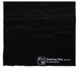
1. Seating Mat